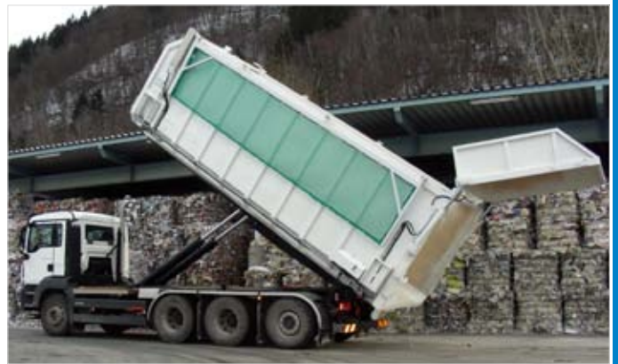
Container with hydraulic tail gate