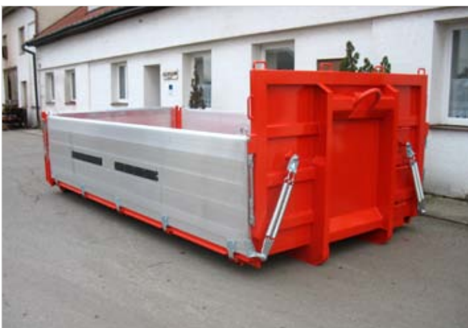
3-way tipper with aluminium side panels

The containers are supplied as standard with a rear-facing two-leaf door, with central locking as well as a safety lock. The containers come standard with a ladder, corner reinforcement and netting hooks. All moving parts, such as door hinges and rollers, come with a lubricating nipple. The containers are primed inside and out and fully painted to your specification / company colours in RAL paints.