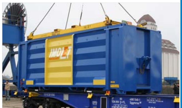
WERNER & WEBER IMOLET® container