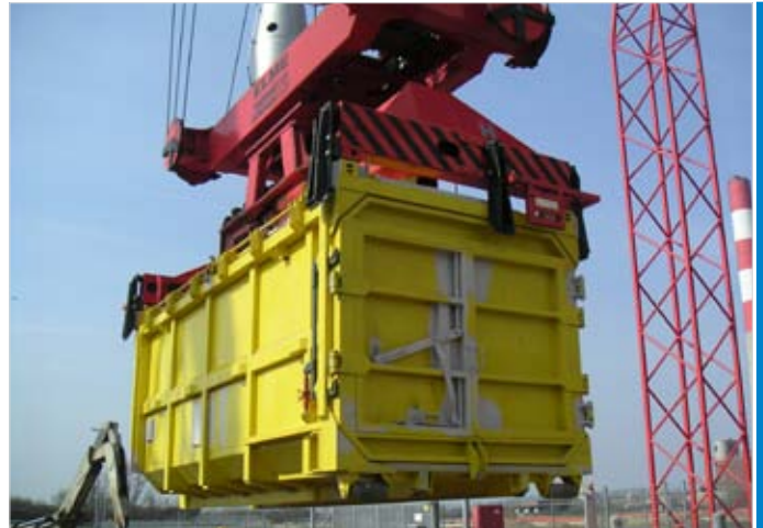
ACTS RO/RO container

WERNER & WEBER 30' containers: WERNER & WEBER supplied the so-called MOCO® (MONTAN COntainer) to MONTAN Spedition, which they developed especially for use in combined transport (preliminary and subsequent leg on the road, main leg by rail). Different MOCO® variants were built, including special MOCOs for loose bulk goods, steel and metal products and also for palletised goods.