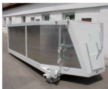
single slide gate