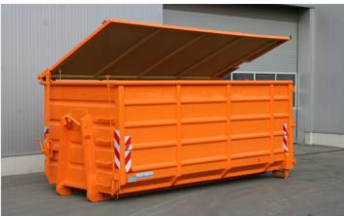
Enclosed container available prompt from stock