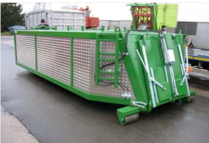
Pneumatic tailgate with 2 slider plates