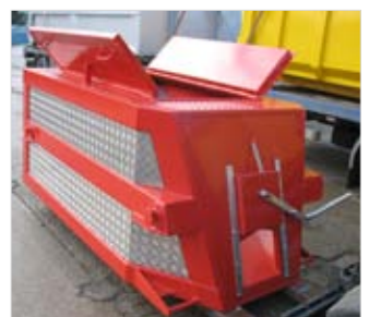
2m 3 container