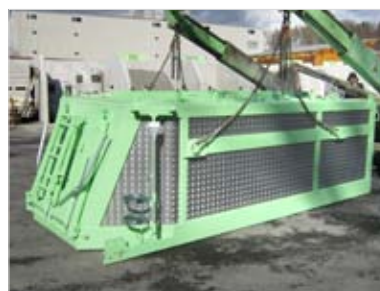
Container for skip truck