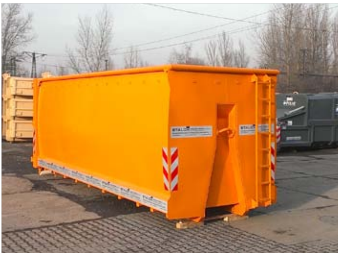
Heavy duty smooth sided container HARDOX 450