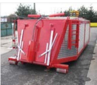
Hydraulic tail gate