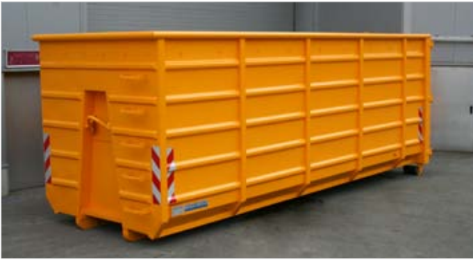
Open top container available prompt from stock