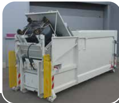
MPC20-N.AT series with tipping device