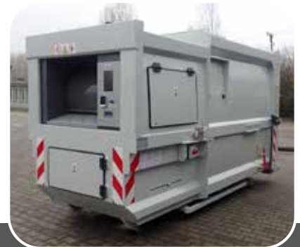
Compactor with weighing system