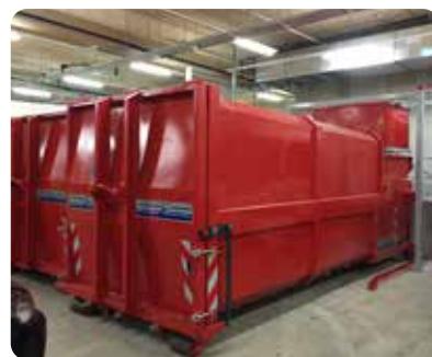
MPC 20-NAT series