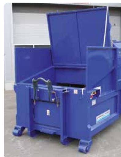
Cover over filling opening

With an attached or stationary mounted container tipping fixture, filling the waste compactor is made even easier. The material can be collected at different locations within the company and then taken to the waste compactor with the help of containers on rollers. The automatic filler process makes work easier for your personnel and reduces costs and the time involved.