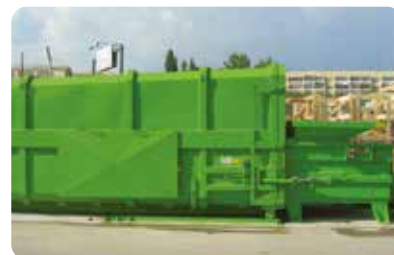
STP-CK waste compactor