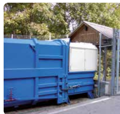
STP-CK with weighing system